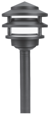
Pagoda Area Light